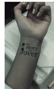
Right: Kyla Cummings Berkley High School Photography Second Place Winner

Interested in registering or scheduling "Tech Talk" Training at YOUR school contact SLS at 248-706-0757 or dmf@SLStoday.org