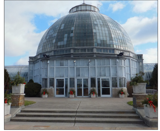
Belle Isle 10:30 a.m.-3 p.m. Aug. 18, 2018

Cost: $5/person Pre-registration and payment required by July 5.