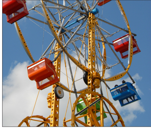
Oakland County Fair - Adaptive Day 9 a.m.-3 p.m. July 12, 2018

Enjoy a magic show, pig races and carnival rides as well as games and activities. Plan on bringing a sack lunch and gym shoes.